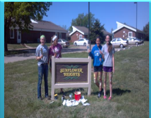
HMS Student Volunteers

The first group of volunteers came from Halstead Middle School. The girls were in 8 th grade and members of STUCO. They spent a day giving back to the community. They did a fantastic job of painting our signs at Meadowlark and Sunflower Heights. They also managed to re-stain the benches in our parking lot.