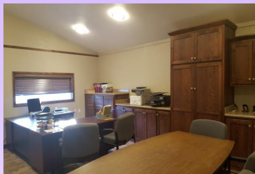
Office view from a couple different angles showing the Office Manager's Desk & Board Table